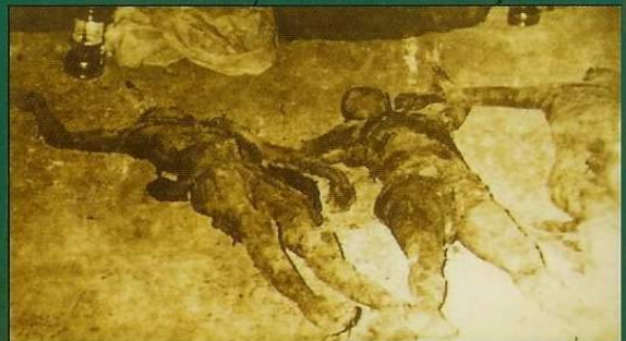
Kimi Türkmenin Gözleri Oyuldu, Kimileri Diri Diri Toprağa Gömüldü

Turkmens that were murdered, hanged to poles and were dragged along the streets