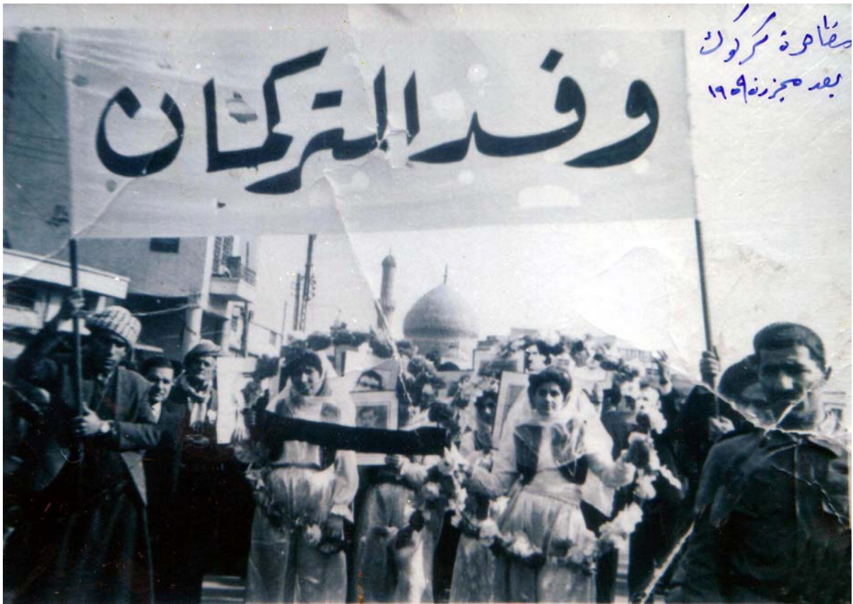
Kirkuk Massacre Protest March

It was 52 years ago today that bloody handed criminals had committed a massacre against Iraqi Turks in Kirkuk with an intention of destroying the community. On 14 th July 1959 it was the first anniversary of the Republic; Kirkuk was decorated with nearly 100 triumphal arches. Ahead of festivities and ceremonies that day the city had a true sense of a feast atmosphere. Children, women and men, the people of Kirkuk were dressed in their National clothes as they were waiting for the ceremony celebrations to start. From 18:00 o'clock onwards the public began to fill the street. They were singing, playing national games with the joy of a feast. At 19:00 o'clock the official parade began.