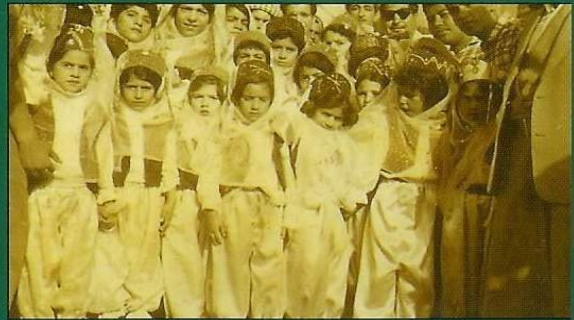
Türkmen Çocukları Kutlama Törenlerine Geleneksel Kıyafetleri İle Katılmışlardı