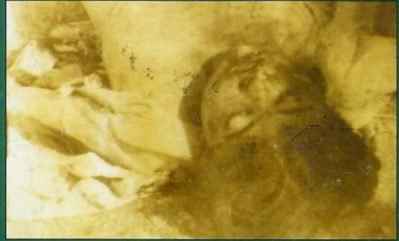
Türkmen Kızı Emel Muhtar Fuat Henüz 13 Yaşlarında İdi