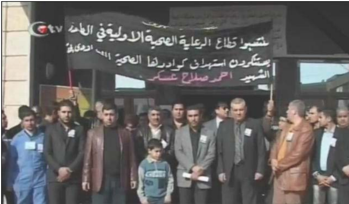
Colloquies of Ahmed Salah Asker who was assassinated by terrorist were condemning the attack

After the explosion corpses were on the ground of the Husseiniya of Sayid al-Shuhada. The suicide bomber managed to enter and blow himself up in the middle of the mourners and no group claimed responsibility of the attack. This attack came after more than four weeks of anti-government protest in the city of Rumadi.