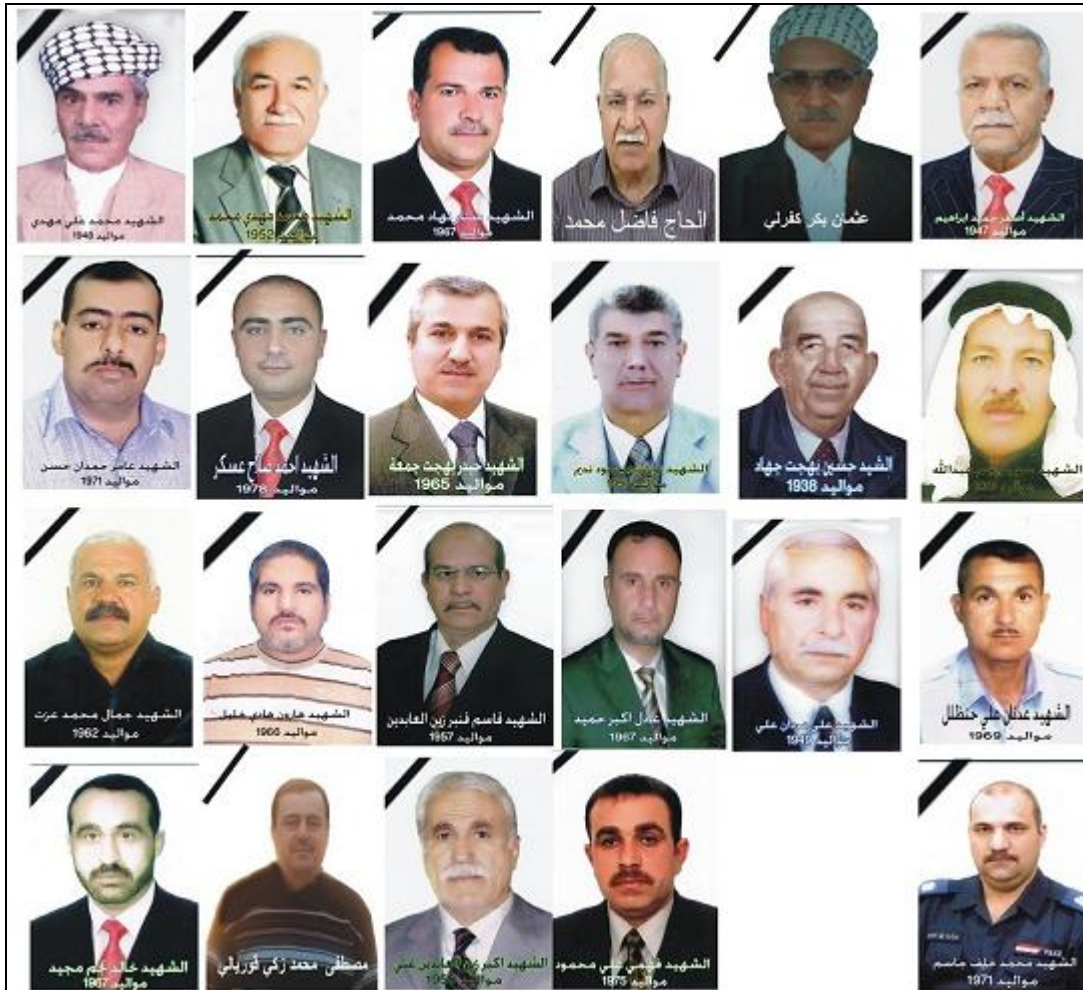
Photos of the some of the Turkmen who killed in the blast at the Husseiniya of Sayid al-Shuhada in Tuz Khormatu

the Turkmen to cease the Kurdish influence, obliteration and aspiration in annexing the city of Kerkuk and other Turkmen lands to Kurdish Regional Government is to establish Turkmen Militia to defend the Turkmen, establishing Turkmen Secret Police, Turkmen National Intelligent Organization and finally establishing Turkmen Assingation Team to assassinate the terrorist who are attacking, targeting the Turkmen and forcing them to leave their homeland Turkmeneli. Otherwise, without having a Turkmen militia, the identity will be completely erased and their homeland will be overtaken by the Kurds to fulfill their dream and aspiration establishing a greater Kurdistan.