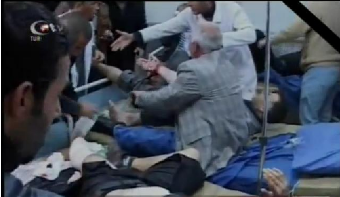
Scenery of the injured Turkmen in the blast at the Tuz Khormatu hospital