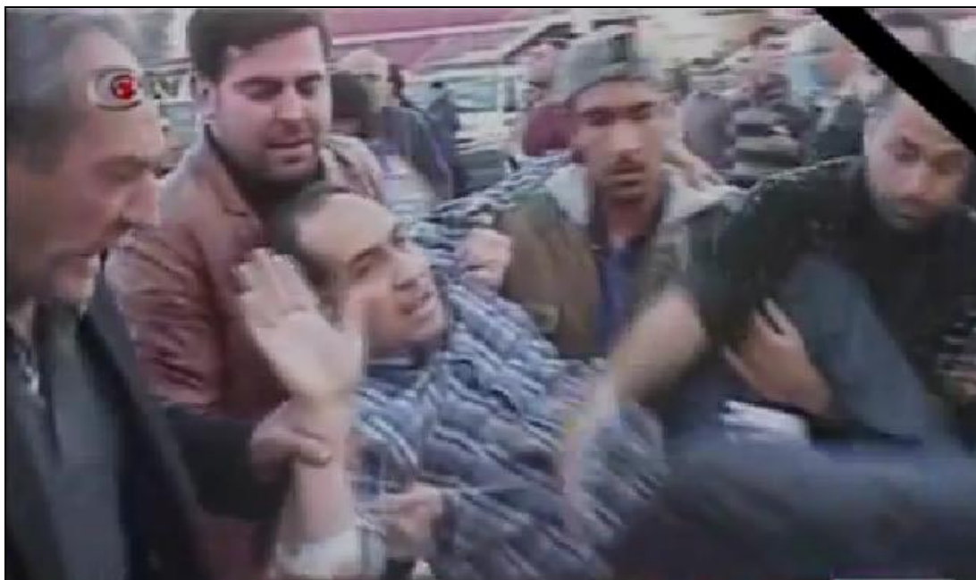
Scenery of the injured Turkmen in the blast of the Tuz Khormatu hospital