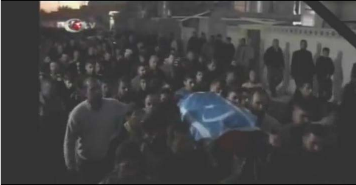
Mourners at the funeral of Turkmen citizen Ahmed Salah Asker wrapped with a Turkmen flag