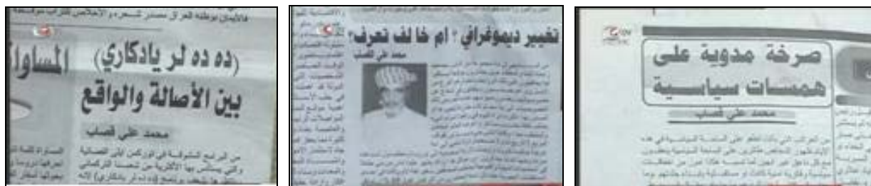
Showing some of his articles that had been published in various newspapers

the Turkmen cause, revealing the injustice and unfairness toward the Turkmen in Iraq. His death was a great lost for the Turkmen.