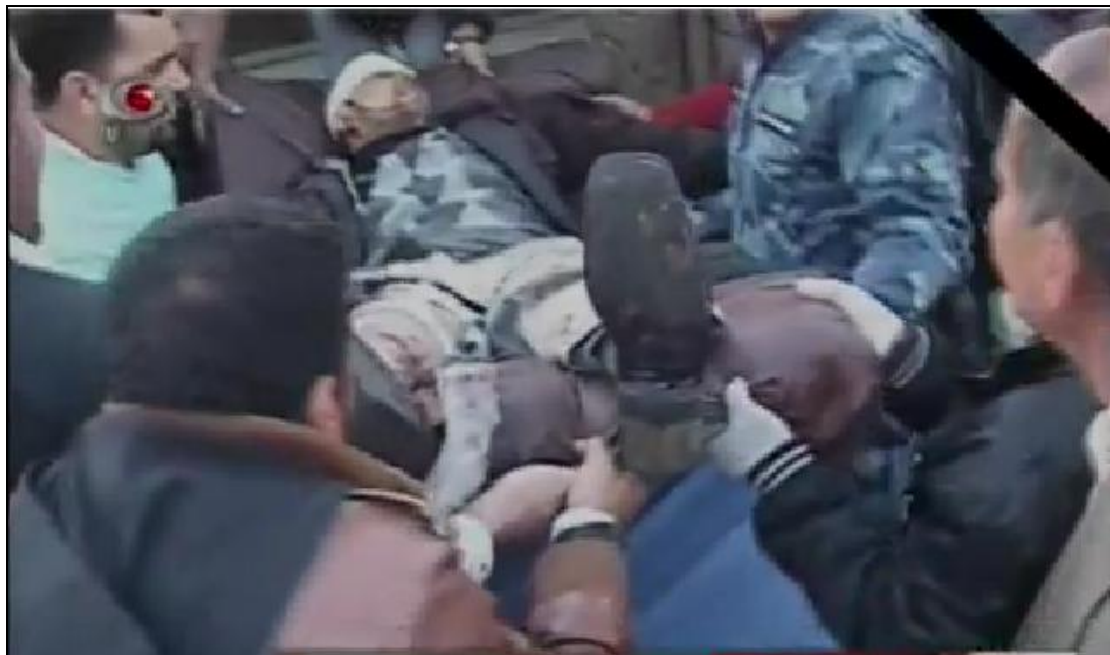
Scenery of the injured Turkmen in the blast at the Tuz Khormatu hospital