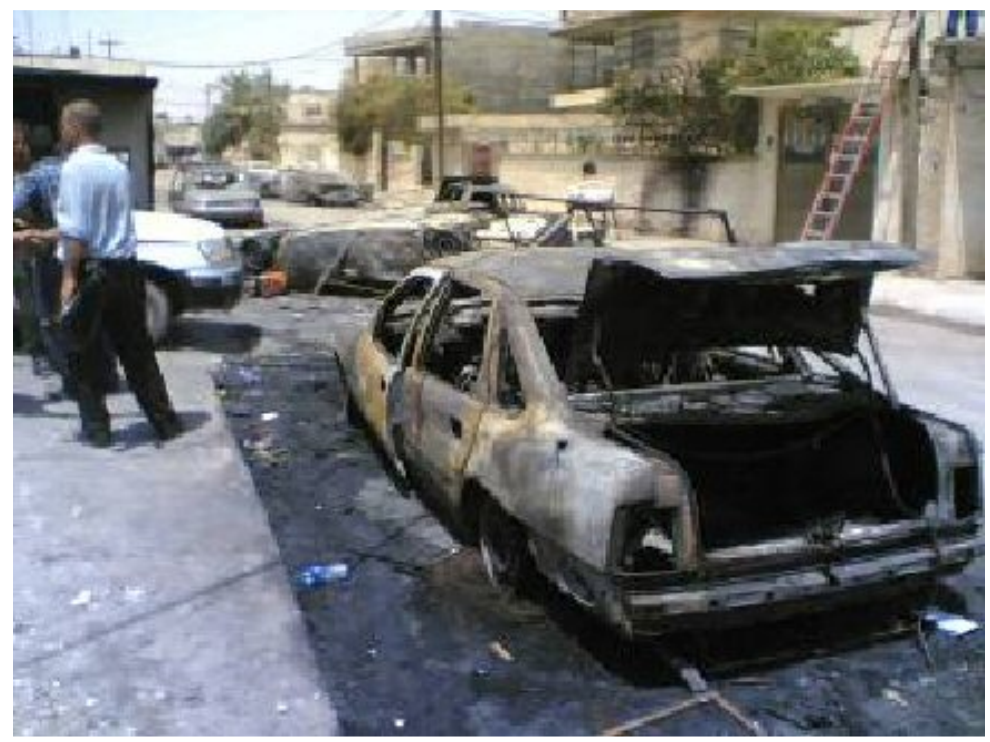
Figure 6. Turkmen properties being attacked by the Kurds

The problem of Kirkuk is not a constitutional one but lies in the ambiguity of Article 140. According to article 140 of Iraqi constitution, the problem of the disputed areas, notably the oil-rich province of Kirkuk, addressed three stages of a normalization and then to conduct a census among the population, followed by a referendum on the fate of areas which will decide whether Kirkuk will join the Conservatives or the Kurdistan region. It was supposed to accomplish those stages during a maximum period up to the 31<sup>st</sup> of December 2007, a deadline which was extended by the united nation representative without the approval of the central government for six months ending on June 30<sup>th</sup>.