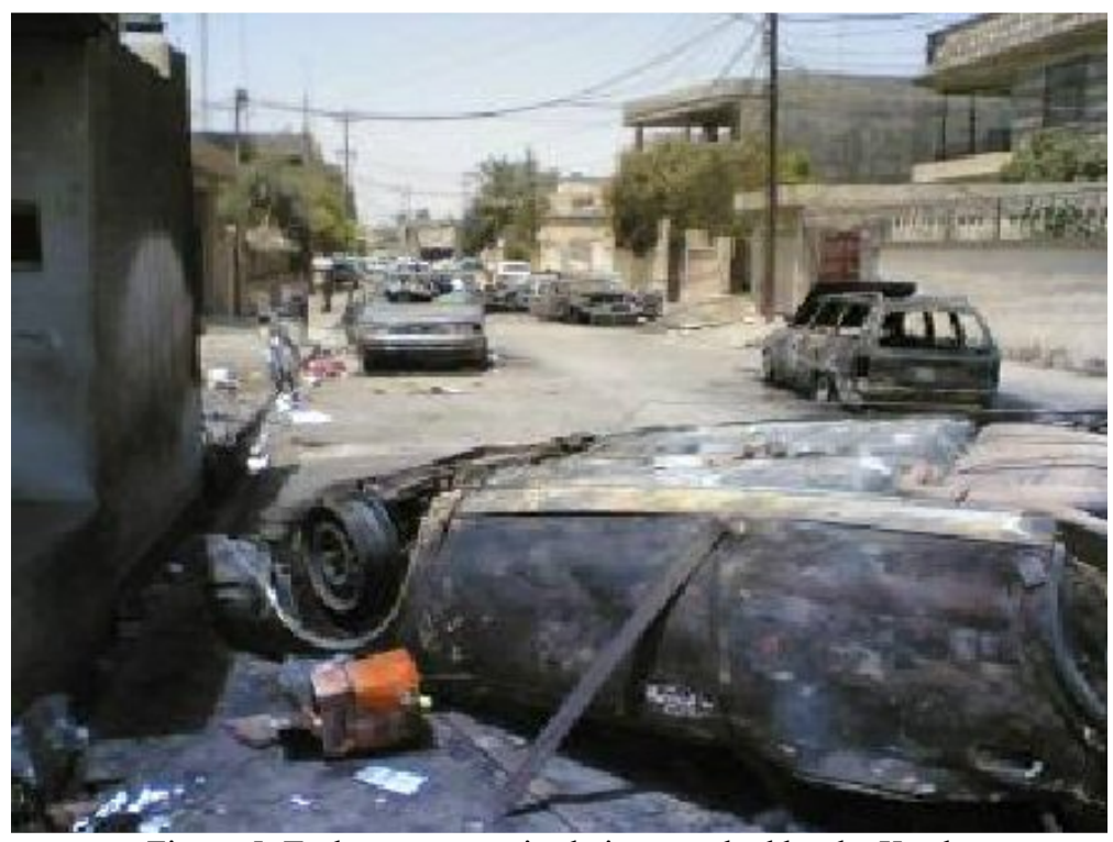
Figure 5. Turkmen properties being attacked by the Kurds

After the explosion, the Kurdish police had set up a check point on the road that leads into and out of Kirkuk. Cars were stopped and searched. Turkmen individuals were taken out of the car and attacked, beaten, abused and their car was smashed before leaving the check point. The attack on the Turkmens was widely condemned by Iraqi politicians, civil organizations and Turkmen organisations but the most striking thing was that Kirkuk governor and Iraqi president Jalal Talabani both of whom are Kurds did not condemn the attack on the Turkmen in Kirkuk.