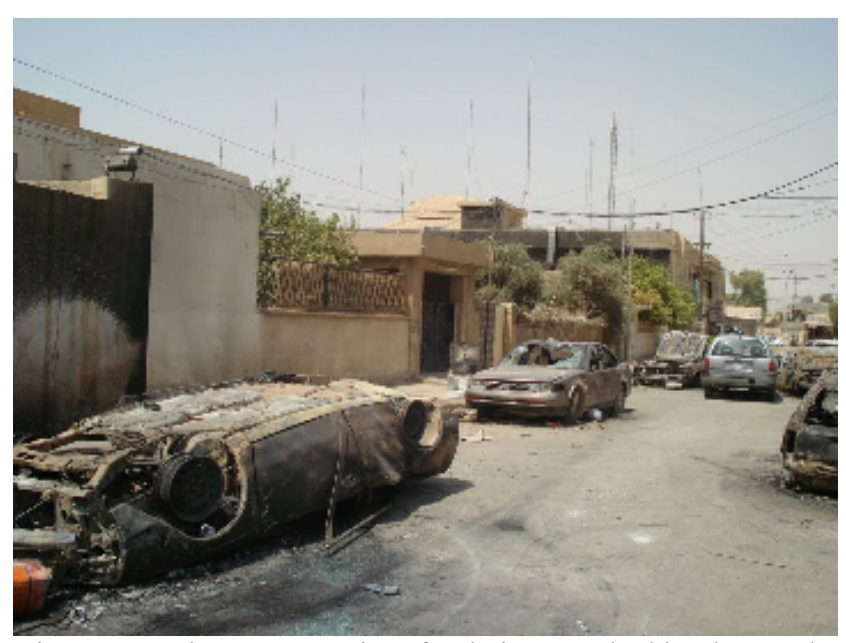
Figure 1. Turkmen properties after being attacked by the Kurds

After the explosion, the Kurdish guards started to open fire, shooting into the air as "Najat Hassam, a senior member of the Kurdistan Democratic Party (KDP), quoted by AFP as saying."More people responded to the gunfire with heavy shooting. The rumours in the towns was that the Kurdish police carried out this attack in order to create chaos, instability and to show the world that they are the victims but the more realistic reason was that to create a civil war thus the Kurdish militia would have a good reason to enter the town with large numbers of Kurdish militia.