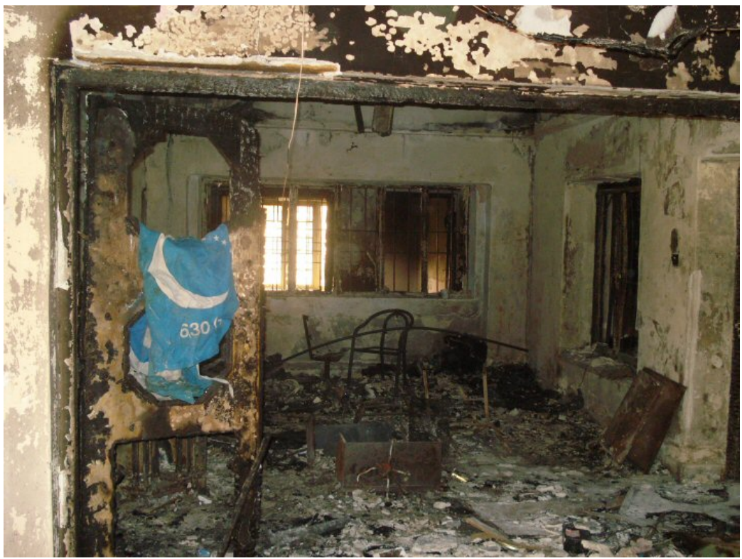
Figure 2. ITF in Kirkuk after being attacked by Kurdish militia

Then the content of the Iraqi ITF building was ransacked and its content was set on the fire. Staff cars and ITF cars were set on fire and all this happened in the presence of the local Kirkuk police whom are mainly Kurds. All these atrocities occurred in the front of the eyes of the US forces and local police. The police forces in Kirkuk didn't take any action against the protesters but kept watching them.