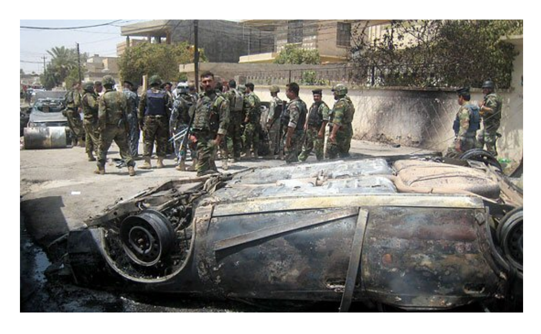
Figure 7. Turkmen properties being attacked by the Kurds

The problem of Kirkuk is not a constitutional one but lies in the ambiguity of Article 140. According to article 140 of Iraqi constitution, the problem of the disputed areas, notably the oil-rich province of Kirkuk, addressed three stages of a normalization and then to conduct a census among the population, followed by a referendum on the fate of areas which will decide whether Kirkuk will join the Conservatives or the Kurdistan region. It was supposed to accomplish those stages during a maximum period up to the 31<sup>st</sup> of December 2007, a deadline which was extended by the united nation representative without the approval of the central government for six months ending on June 30<sup>th</sup>.