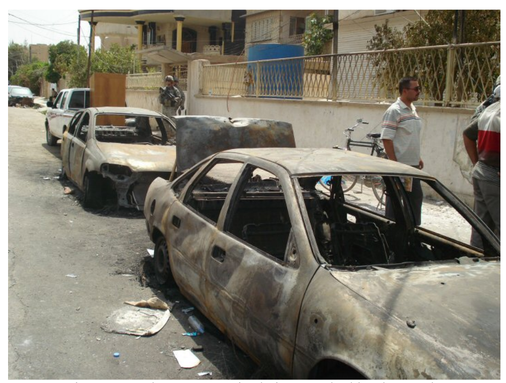
Figure 3. Turkmen properties being attacked by the Kurds